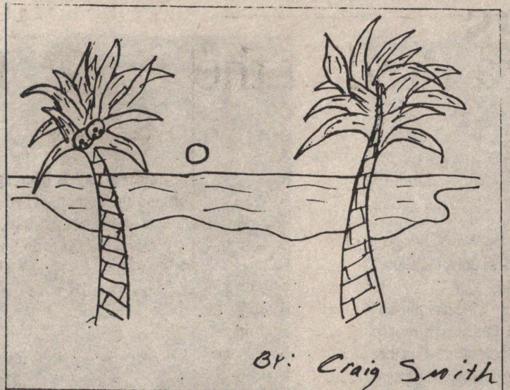
Picture this: Your sitting on the beach, looking out off the coast of Aruba, dazing at the sunset.

Staying in St. Thomas is no problem. There are many hotels. One of the main hotels is Marriots Frenchman's Reef Beach Resort. It