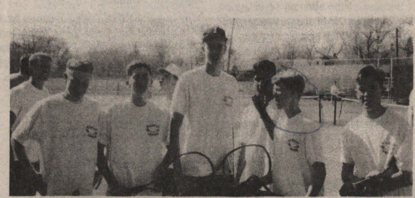
UPDATE on boys tennis team - page 11