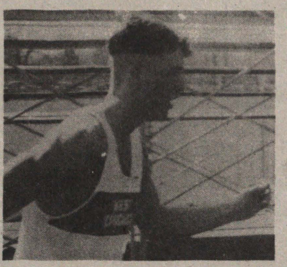
UPDATE on boys track - page 10